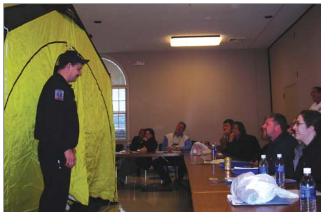
Leadership Central Kentucky class members got an overview of one of the pieces of equipment that BERT (Bluegrass Emergency Rescue Team) uses during their visit to Clark County.

We then arrived at the future home of the Winchester-Clark Co. BCTC