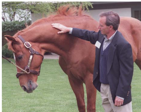
Former jockey Steve Cauthen (above) had 447 winning rides in 1977 and graced the covers of TIME and Sports Illustrated at a young age.

Cauthen will talk about his transition from the sporting world to the business world, touching on challenges he had to overcome and lessons learned.