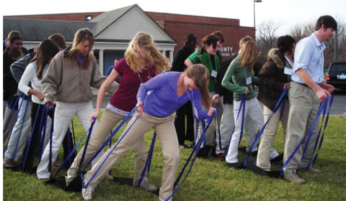
Leadership Lexington Youth class members participated in a teambuilding exercise at the 4-H Extension office during its Mid-Year Retreat and Diversity Day.

Fuller Mossbarger Scott & May Engineers, Inc.