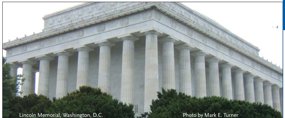
Lincoln Memorial, Washington, D.C.

Kentucky Eagle Beer, Inc. Lexington-Bluegrass Association of Realtors Thomas and King, Inc.