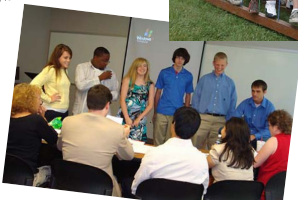
LEFT: First place team, Getthejewelry.com, gets advice from the panel of judges.