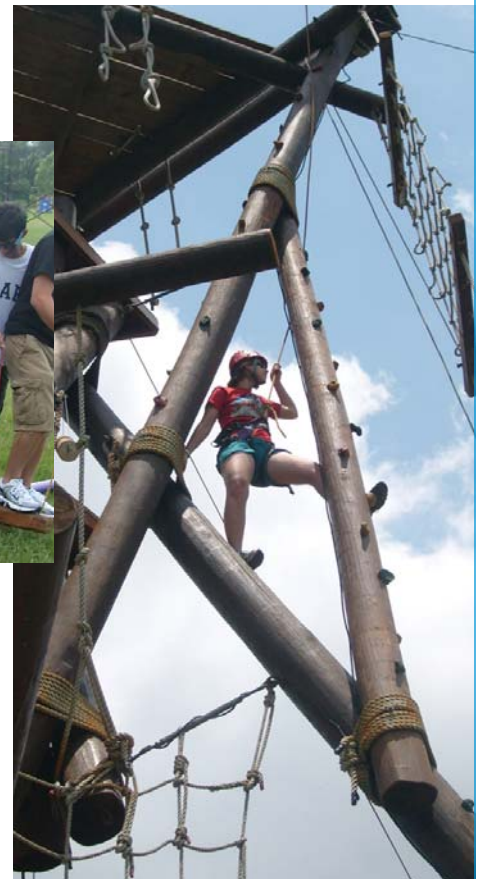
RIGHT: Climbing the tower at the Georgetown Challenge Course.