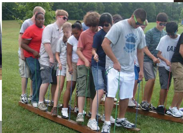
BELOW: Teamwork at the Georgetown Challenge Course.