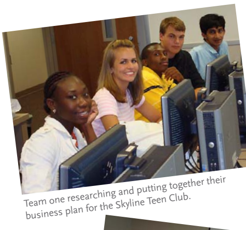
Team one researching and putting together their business plan for the Skyline Teen Club.