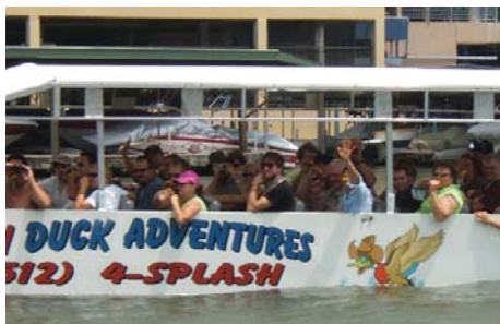
AUSTIN DUCK TOUR

Thanks to the sponsorship of 12 Bluegrass