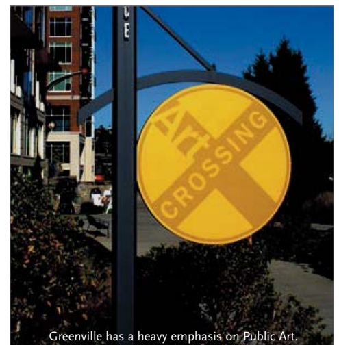
Greenville has a heavy emphasis on Public Art.

Review the agenda, speaker bios, information about Greenville, and attendees.