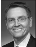
City of Lexington Jim Gray Mayor