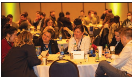
Table discussion during EMERGE.

A variety of breakout sessions covered topics such as personal branding, innovation, cryptocurrency, stress management, neighborhood development, goal setting, the art of debate, and more. Thank you to everyone who attended, sponsored, volunteered, helped plan a session, or presented during the conference. Your involvement has built EMERGE into a quality, award-winning event that has now expanded to a full year of programming through the Emerging Leaders of the Bluegrass.