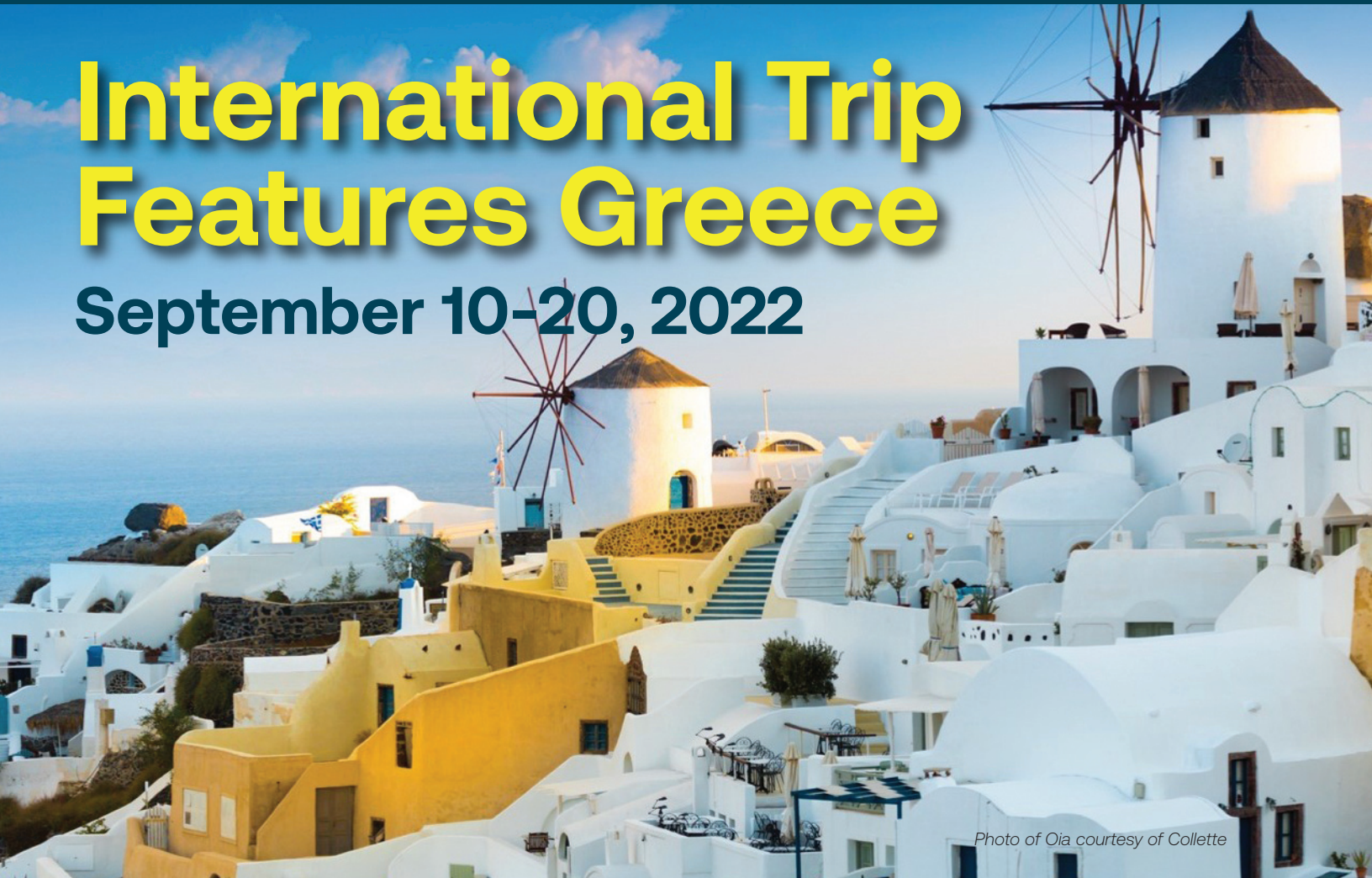
Photo of Oia