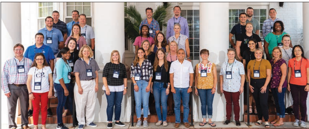
Leadership Lexington 2021-22 class