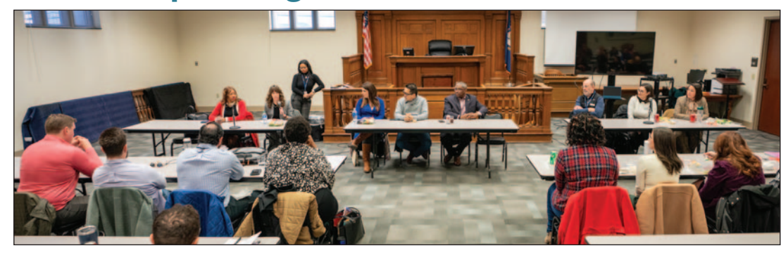
During Government Day, Leadership Lexington class members had a discussion with Lexington city councilmembers.