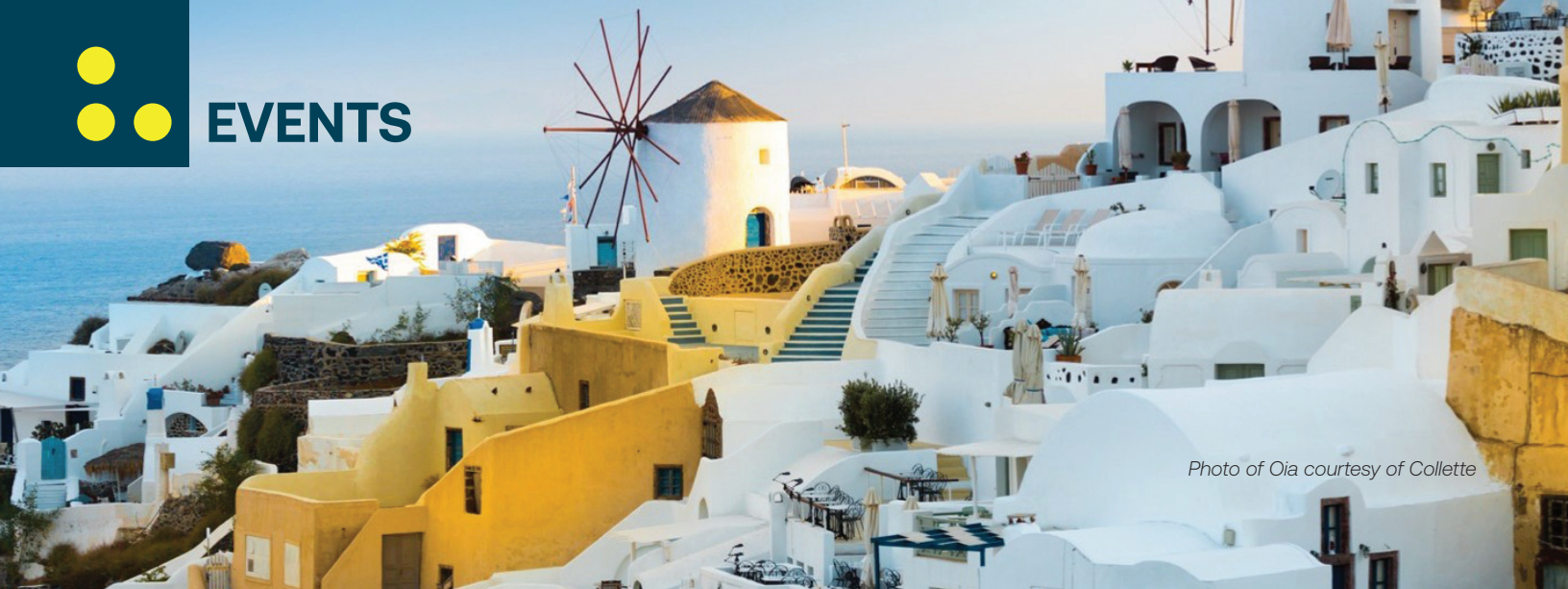
Photo of Oia