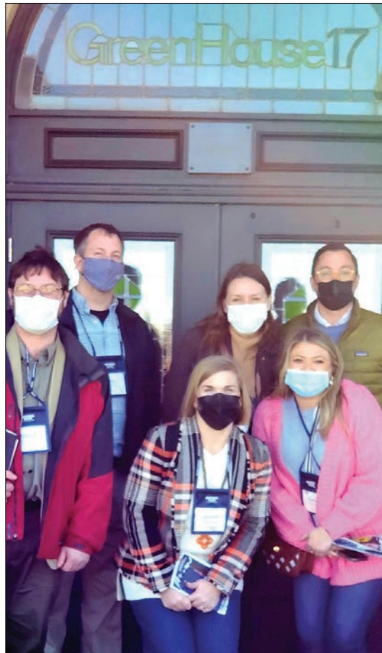
A group of Leadership Lexington class members visited GreenHouse17 during Health & Human Services Day.