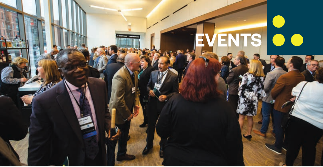
2022 An Evening With Commerce Lexington