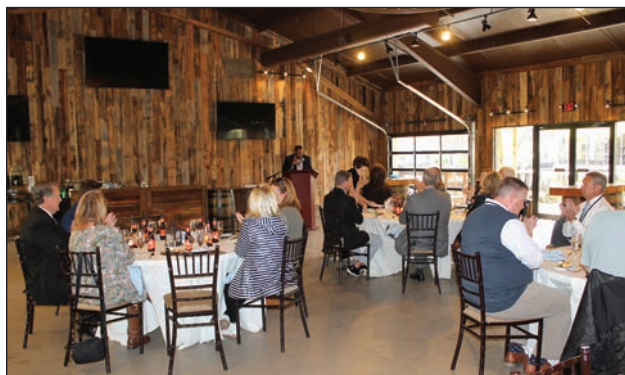
ABOVE: Volunteers & campaign leadership celebrated their success during the Mid-Campaign Luncheon at Fasig-Tipton.

If you have thought about marketing your business or organization through the opportunities available at Commerce Lexington events or in publications, now is a great time to check out the sponsorships for late 2022 or 2023 that meet your marketing needs.