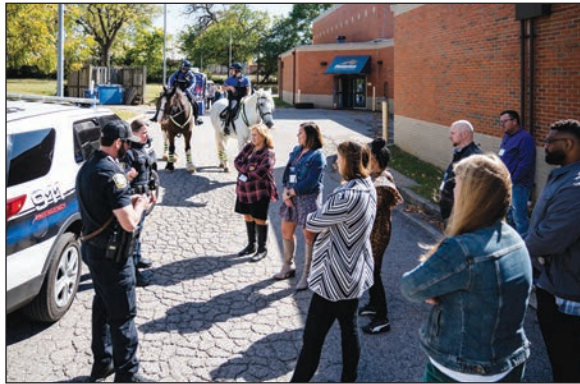
The Leadership Lexington class participated in Public Safety Day on October 13.