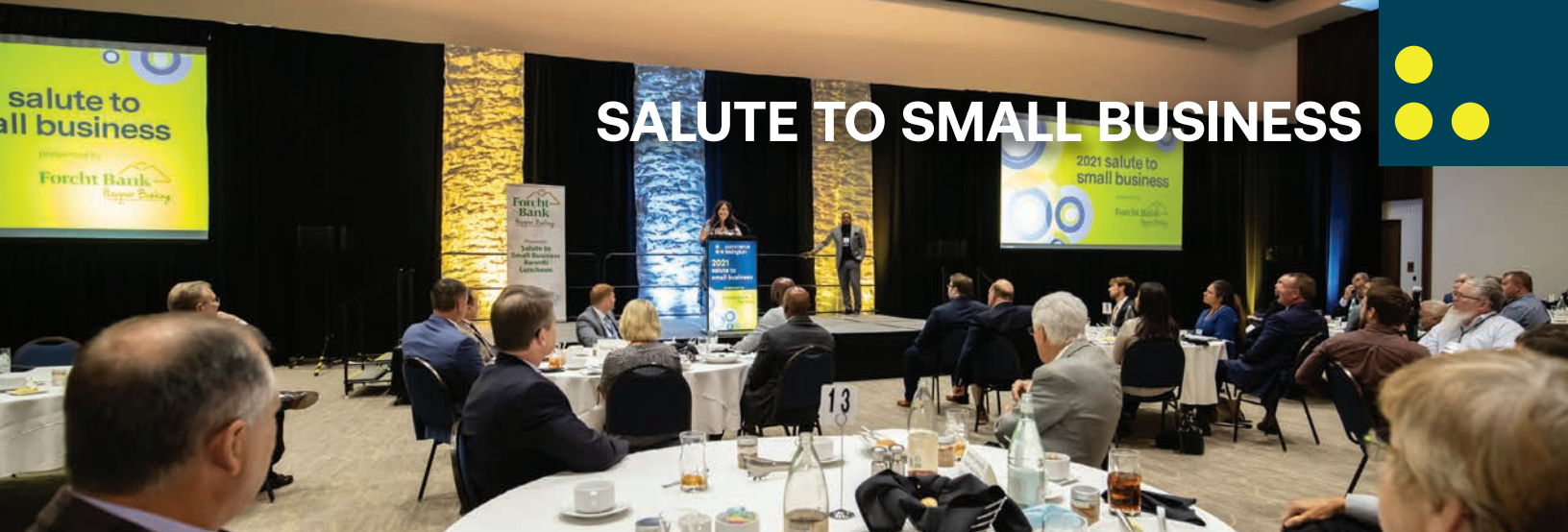
2021 Salute to Small Business