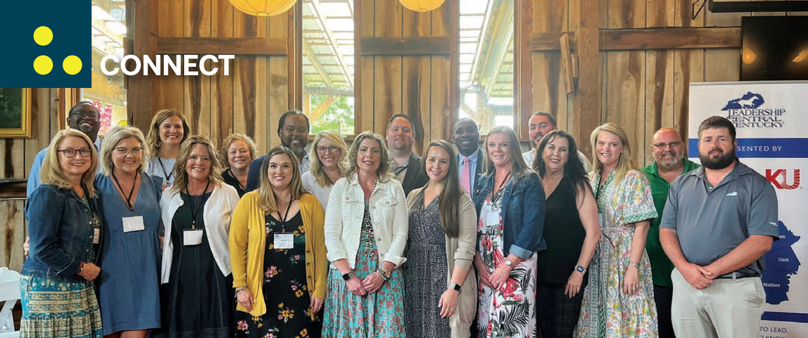
2021-22 Leadership Central Kentucky class during Reflection and Graduation Day on May 18th at Equus Run Vineyards.