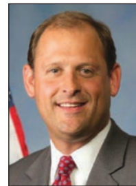
CONGRESSMAN ANDY BARR

Andy Barr has served as Congressman for Kentucky's Sixth Congressional District since January 2013. Congressman Barr is a senior Member of the House Financial Services Committee and is Ranking Member of the Financial Services Subcommittee on National Security, International Development and Monetary Policy. In the 117th Congress, Congressman Barr also began serving on the House Foreign Affairs Committee, and serves on the Foreign Affairs Subcommittee on Asia, the Pacific, Central Asia and Nonproliferation.