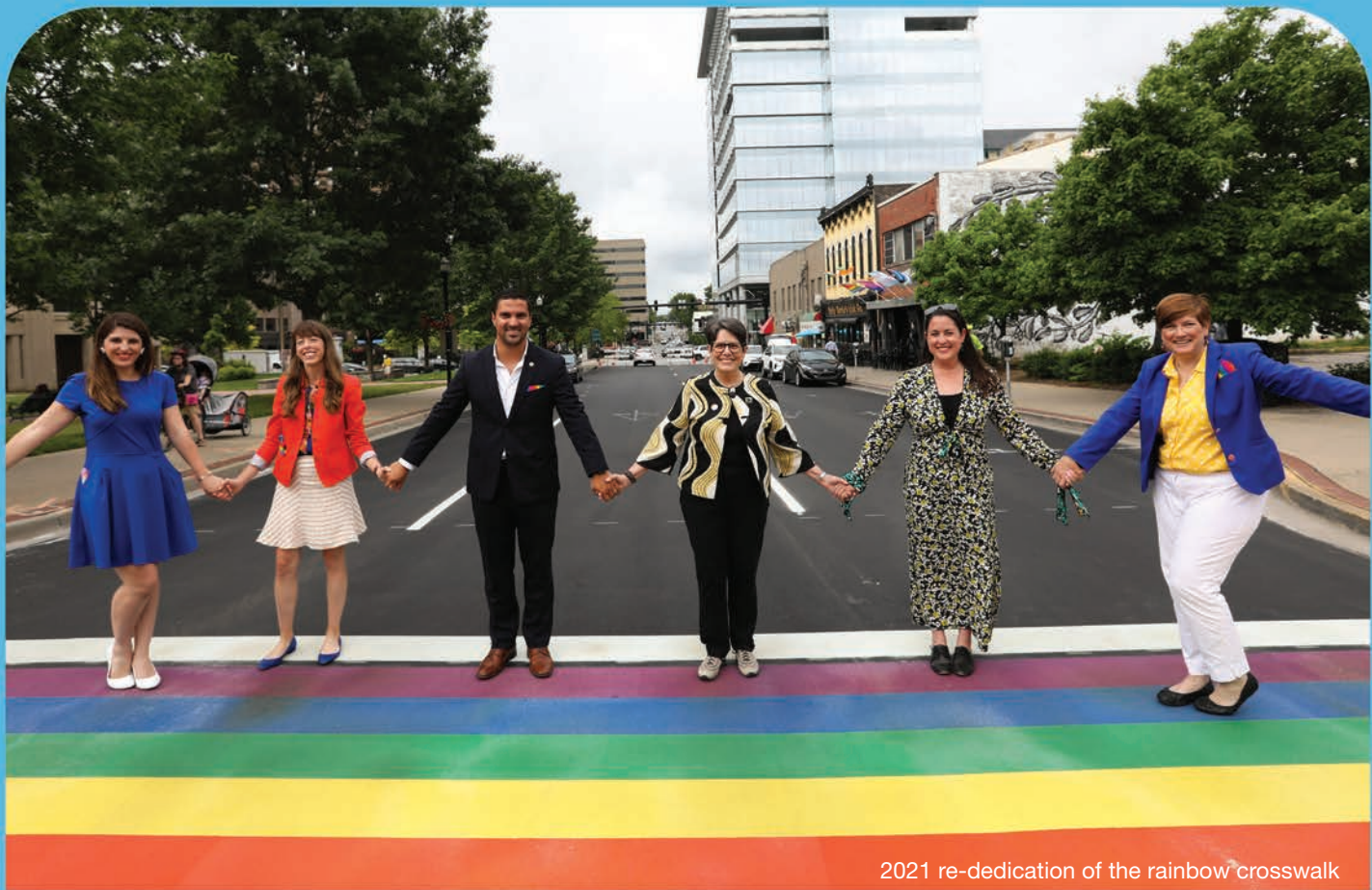
2021 re-dedication of the rainbow crosswalk