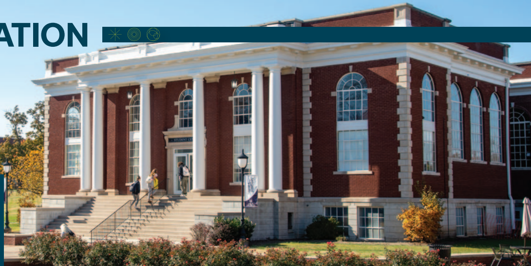
Asbury University

The abundance of higher education institutions within the Bluegrass Region brings an infusion of students each fall, and with it comes big dreams and big ideas. The impact of which has produced a very well-educated workforce leading to the area's diverse economy.