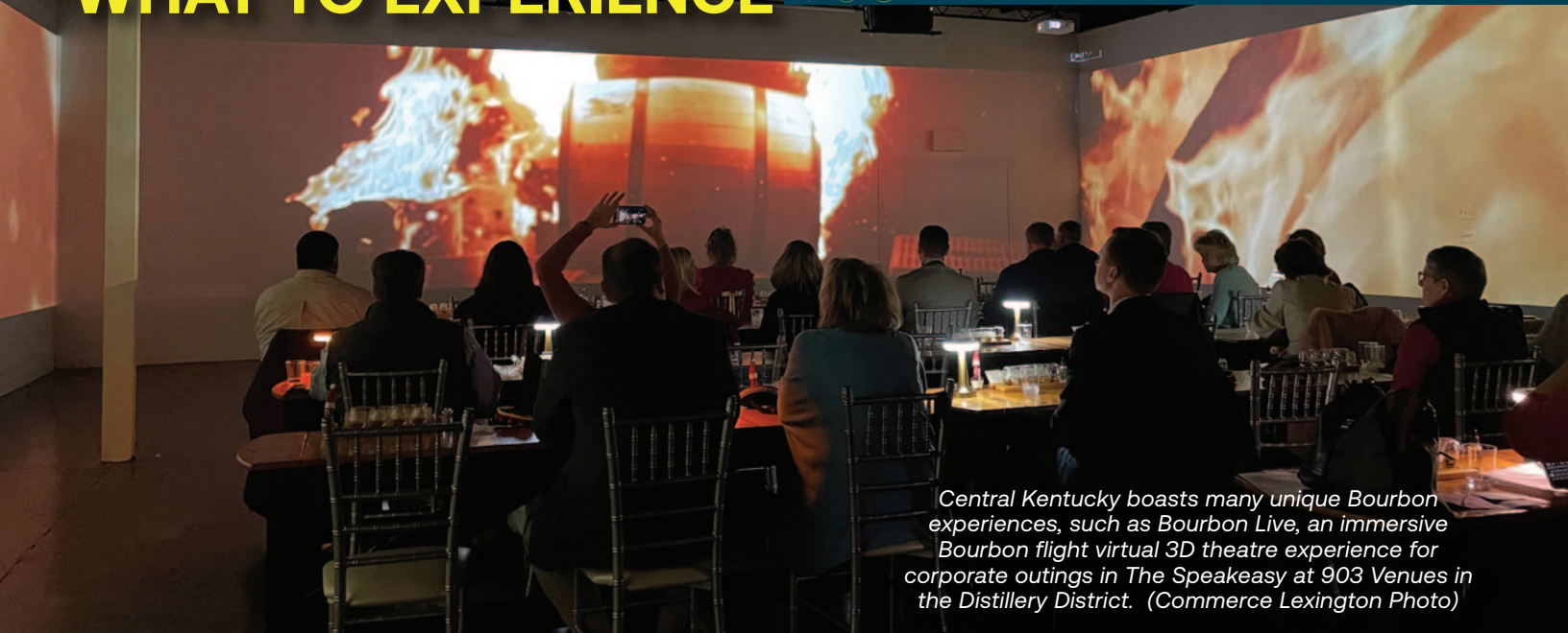
Central Kentucky boasts many unique Bourbon experiences, such as Bourbon Live, an immersive Bourbon flight virtual 3D theatre experience for corporate outings in The Speakeasy at 903 Venues in the Distillery District.

As the “Horse Capital of the World,” the Bluegrass Region has no shortage of horse-related activities – from horse farm tours to a day at the races to elegant equestrian events. One place you won’t want to miss is historic Keeneland Race Course, which offers Thoroughbred racing in April and October, and horse sales throughout the year.