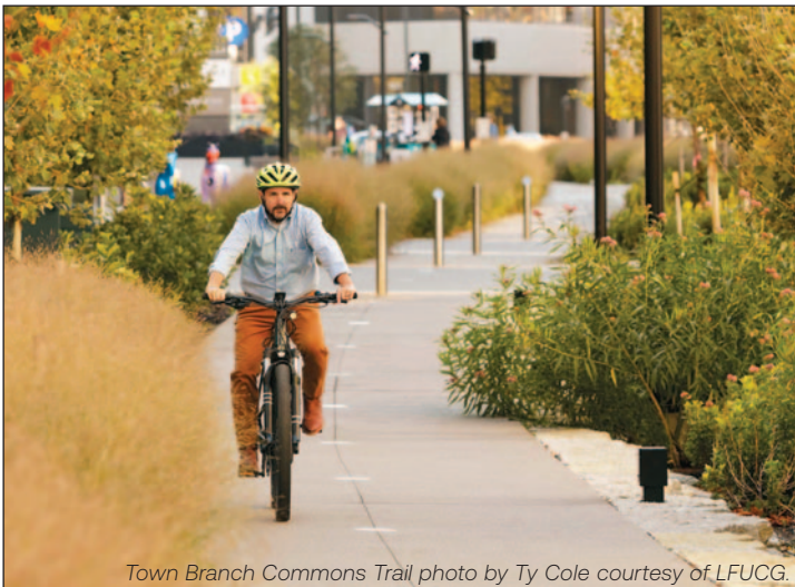
Town Branch Commons Trail photo by Ty Cole courtesy of LFUCG.

Whether it's skateboarding, swimming or jogging, Lexington's Parks and Recreation has a lot to offer. Currently, there are more than 100 parks consisting of more than 4,000 acres in Lexington. The parks system includes athletics, after school programs, aquatics, community centers, cultural arts, day camps, dog runs, equestrian, fitness trails, golf, gymnasium, natural areas, playgrounds, rental facilities, senior adult programs, special events, therapeutic recreation and open spaces for passive recreation. To find out more, call (859) 288-2900 or visit www.lexingtonky.gov/browse/recreation .