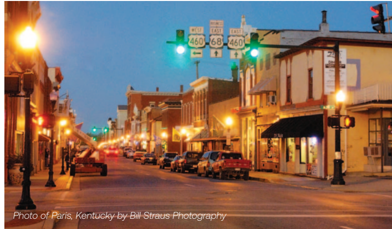
Photo of Paris, Kentucky

Located less than two miles to the south of Lexington, Nicholasville in Jessamine County is another one of the state's fastest-growing places. It is home to the R.J. Corman Railroad Group, which was founded in 1973 and now operates in 23 states. Meanwhile, nearby Wilmore is home to Asbury College. For more information, visit www.jessamineco.com , www.jessaminechamber.org , www.nicholasville.org and www.wilmore.org .