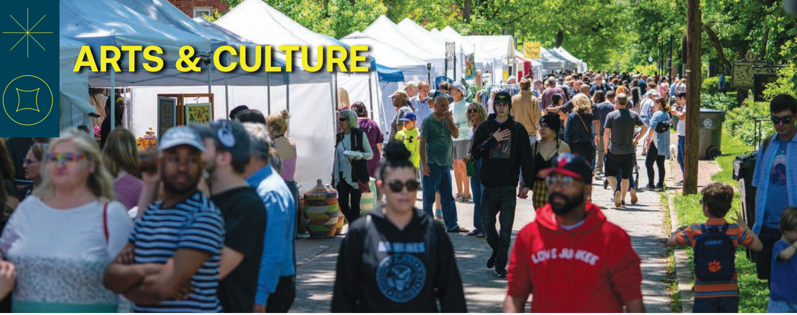
Mayfest Arts Fair (May 11-12, 2024) is a juried art fair with a focus on a casual, family-friendly atmosphere. Included are up to 100 Artist Vendors, performances by musicians, dancers, strolling performers, food concession vendors, and family activities.

Whether you're in the mood for great musicals, national and international museum exhibits, art galleries, charming children's productions, outdoor performances, or touring Broadway plays, Lexington hosts a variety of arts and cultural opportunities that fit many interests. Leading the way for the advancement of the arts locally is LexArts, Lexington's cultural development, advocacy and fundraising organization. LexArts provides a wide range of programs and services designed to integrate the arts into our community. Through its annual Fund for the Arts, LexArts raises millions of dollars in support of local arts and distributes general operating support to its partner organizations, as well as offering competitive special project and programming grants to other arts organizations in the area.