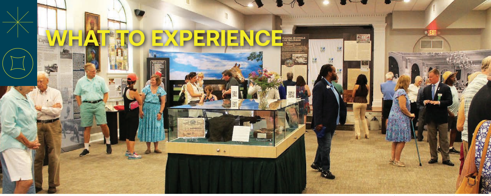
The Lexington History Museum re-opened to great fanfare at its new home on North Broadway with updated exhibits and programming.

As the "Horse Capital of the World," Greater LEX has no shortage of horserelated activities - from horse farm tours to a day at the races to elegant equestrian events. One place you won't want to miss is historic Keeneland Race Course, which offers Thoroughbred racing in April and October, and horse sales throughout the year.