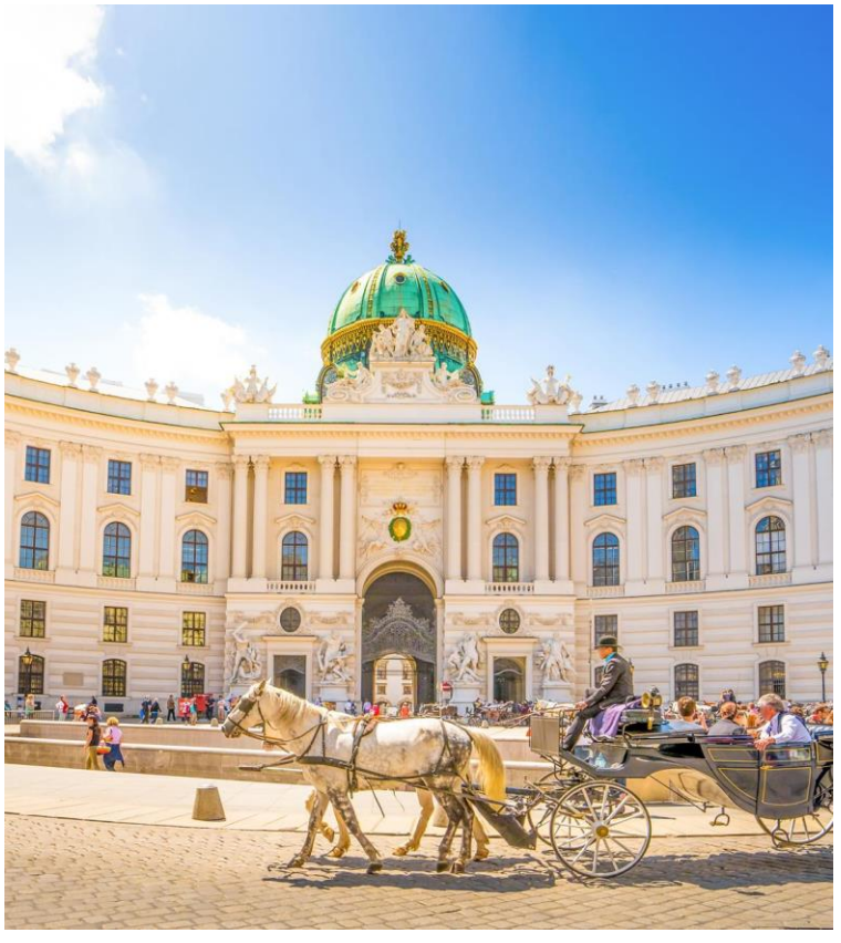
11 Days • 15 Meals: 9 Breakfasts, 1 Lunch, 5 Dinners

HIGHLIGHTS... Prague, Prague Castle, Cesky Krumlov, Vienna, Schönbrunn Palace, Classical Music Performance, Choice on Tour, Bratislava, Lunch with Locals, Budapest, Matthias Church, Fisherman's Bastion, Visegrad, Renaissance Dinner