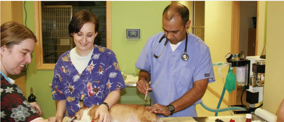
Bluegrass Veterinary Specialists Access Loan Program Client

Senior Vice President, Community & Minority Business Development Commerce Lexington Inc. 330 E. Main St., Suite 100 Lexington, KY 40507 Phone: (859) 226-1625 ttyra@CommerceLexington.com