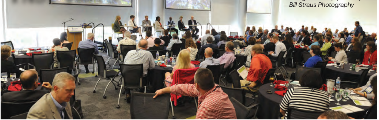
Raleigh 2019 trip photo by Bill Straus Photography