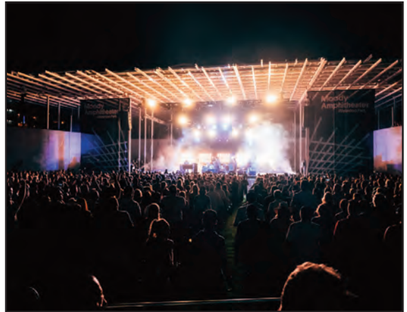
Moody Amphitheater at Waterloo Park

Lexington was recently recognized for its murals across the city, while the Abraham Lincoln mural facing Vine Street in Lexington was named to the top 20 Best Murals to Take a Selfie With by USA Today earlier this year. Austin is also home to some amazing street art and there are some incredible murals in Austin. Colorful art decorates many of its streets, to the extent that many of the murals have become tourist destinations in themselves! You'll find a list of the 17 best murals in Austin on-line at www.thewholeworldisplayground.com/best-murals-in-austin .