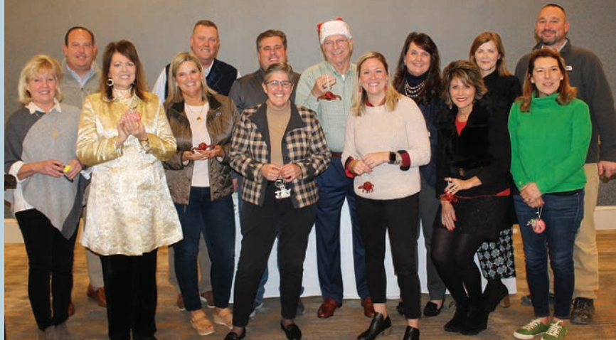
Winner's Circle top producing volunteers were recognized during the Victory Luncheon on December 17th at the Griffin Gate Marriott Resort & Spa.