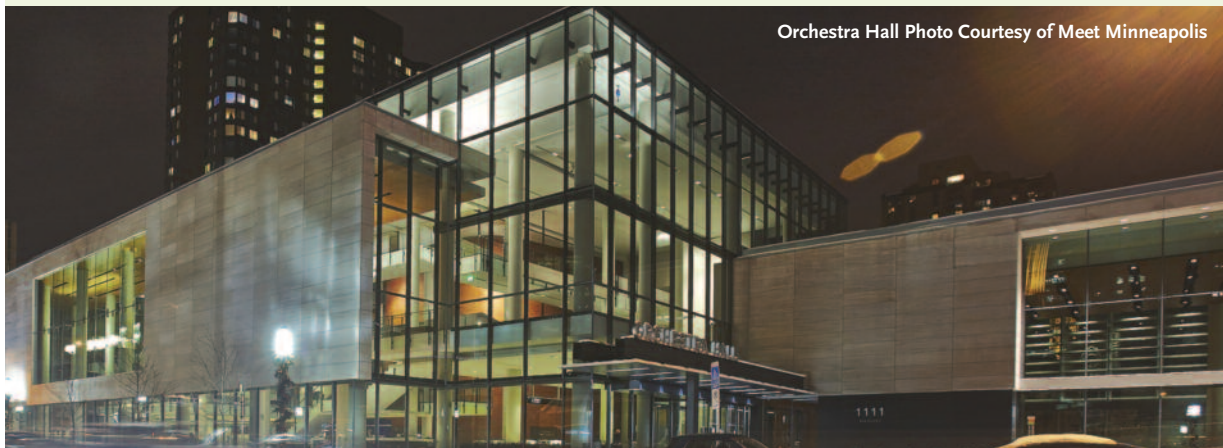
Orchestra Hall